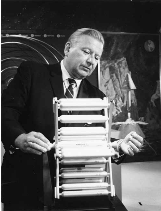
Space pioneer Krafft Ehricke (1917-1984) saw, in space travel and the colonization of the universe, the natural next phase of the evolution of mankind, and in the industrialization of the Moon, the springboard for man's exploration of the Solar System and beyond. Here, he demonstrates how an orbital hospital might be designed.

dustrial exploitation of the Moon. In the first phase, this involves robotic infrastructure for work on the Moon, thus, among other things mobile cranes, dredges, and cable-laying machines. After the landing probe “Luna Globe 1” in 2015, and the orbital module “Luna Globe 2” in 2016, then in 2017 the hard-landing apparatus “Luna Resource,” developed together with the Indian Space Research Agency, will reach the lunar surface and, among other tasks, convey the Indian lunar vehicle onto the Moon.