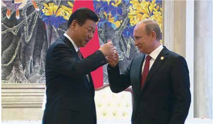
Russian President Putin and Chinese President Xi, in Shanghai in May, reached a series of bilateral accords, and published a declaration of intent to create a new economic architecture in the Asia-Pacific region.

Of still greater importance is President Putin's support for President Xi's strategic initiative to expand the New Silk Road. Their common statement says: "Russia recognizes the enormous significance of the Chinese