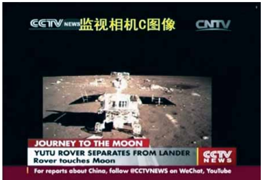
The success of the Chinese Chang’e-3 mission this past December, with a soft landing of the “Jade Rabbit” (Yutu) rover on the Moon, was a milestone in achieving the goal of moving to a thermonuclear fusion-based economy fueled by helium-3.

Today, this necessary next discovery, which defines the future for the entire world, is the conquest of the energy source that will bestow energy and raw materials security on mankind for thousands of years into the future: the utilization of thermonuclear fusion power on the basis of helium-3.